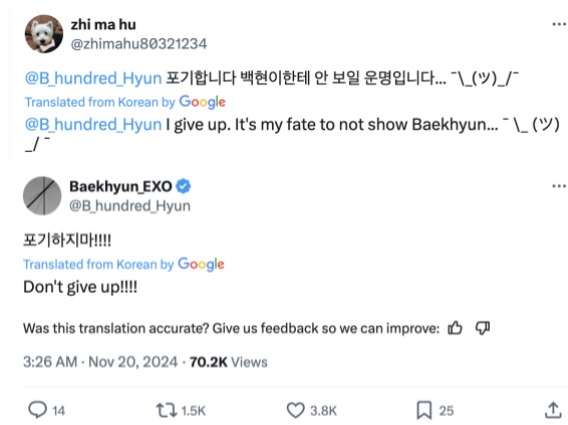
Figure 4. Idol and fan interaction.

This TR also encourages fans to interact with the content, such as liking, commenting, or participating in live interactions like Q&A sessions. Fans feel reassured that their engagement—whether a comment or a shared post—is being seen or acknowledged by the idols or their teams. As shown in Figure 4, an idol interacts with their fans by replying to the fans’ post. This sense of direct connection strengthens the bond between idols and fans, motivating fans to remain active and engaged within the fandom ecosystem.