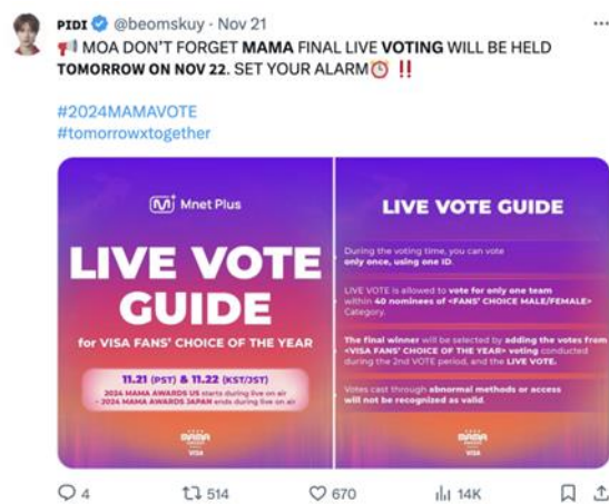
Figure 2. Voting guides and tutorials