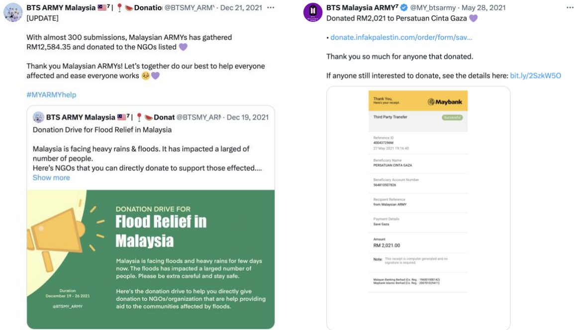
Figure 5. Charity on behalf of idols.

The high level of TR among community members significantly enhances their ability to achieve collective goals. Whether it's trending hashtags, surpassing streaming milestones, or raising funds for charitable causes, the seamless collaboration enabled by TR ensures that these efforts are successful. Moreover, this TR strengthens the fandom's cohesion, making fans more likely to engage in future activities and invest further in the community.