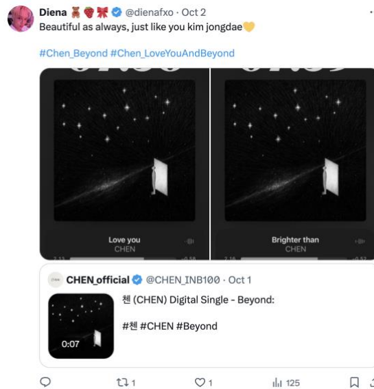
Figure 3. Fan reposts