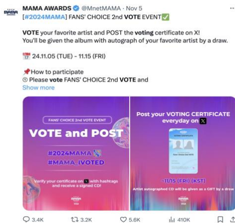
Figure 1. Voting channel at MAMA awards.

Platforms like X stand out because they offer features that align with fans' needs, such as verified accounts, secure login systems, and robust privacy measures. These elements foster TR by ensuring that fans' personal data and content are protected, which is particularly important given the emotional and time investment fans put into these platforms.