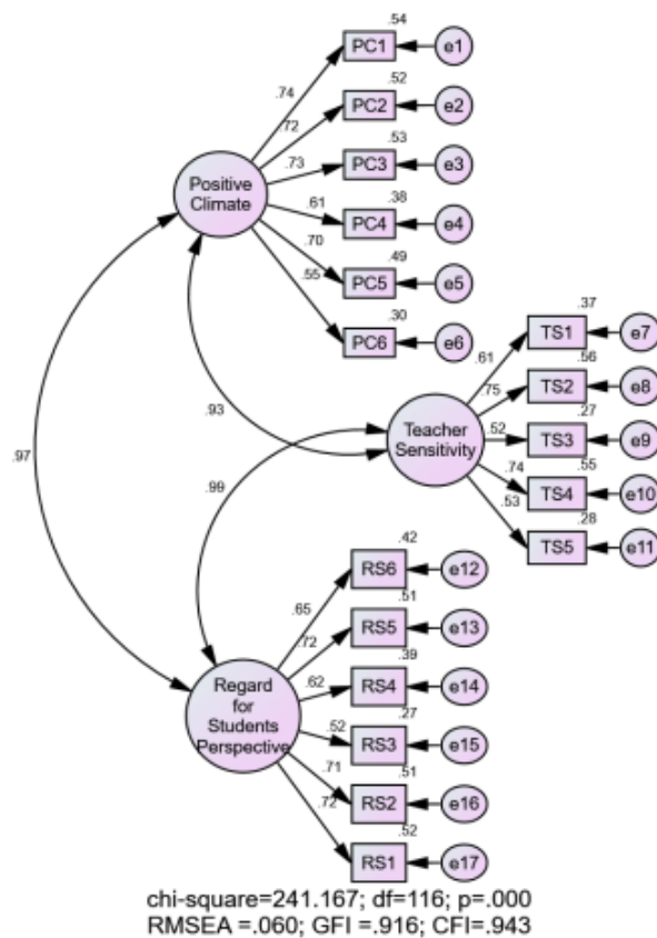
Figure 1. Confirmatory factor analysis results of the proposed model.

In conformity with the conceptual framework, the three-factor model for teacher emotional support, qualified for an acceptable fit adequacy: CFI = 0.943 (Bagozzi & Ye, 1988) , GFI = 0.916 (Hoyle, 1995) , RMSEA = 0.060 (Browne & Cudeck, 1992). Figure 1 showed the high standardized estimated of factor loadings. The values ranged from 0.52 to 0.73 and t values were significant. Additionally, showed that positive climate is significantly related to teacher's sensitivity ( r = .093 , p < .01 ) as well as to regard for students' perspective ( r = .097 , p < .01 ). It can also be seen that teacher sensitivity and regard for adolescent perspective ( r = 0.99 , p < .01 ) were positively and significantly related. However, it should be noted that the p-value of the three-factor model of all the items yield a significant value of p = 0.000 . This implies that there could be overlapping of items in the three dimensions. A maximum likelihood was performed to identify communalities. This leads to a suggested three-factor model which is shown in Figure 2.