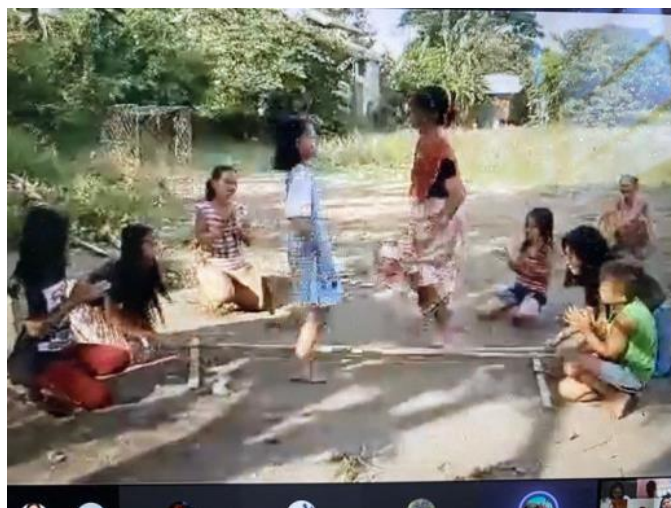
Figure 4. A first year student had to gather her neighbours to dance Tinkling with her.

Below is a photo showing how one first year student had to gather her neighbours to dance Tinkling with her. Some of the children and even adults served as audience.