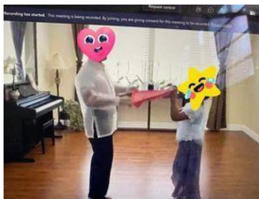
Figure 1. Photo showing a return demonstration by a student.