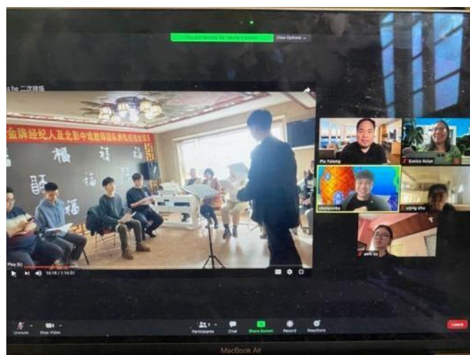
Figure 3. ERT initiative by the innovative Music faculty in their requiring collaborative performances.

Apart from the use of technology to demonstrate performance-based concepts and skills and for return demonstration, the participants of the study also innovated collaborative performances to realize their set course and learning outcomes during their emergency remote teaching from the onset of the pandemic until the second semester of academic year 2021-2022. Like other Music faculty, P3, part-time Choral Conducting instructor, was still able to teach the course remotely through collaborative performances. For example, his students who went home to China organized their own choir in their community. The Music students interviewed reported that they were still able to maximize learning through the creativity of their teachers who designed requirements that helped them develop not just about Music but also other social emotional skills such as collaborating for their tests or performances. This photo demonstrates this ERT initiative by the innovative Music faculty in their requiring collaborative performances.