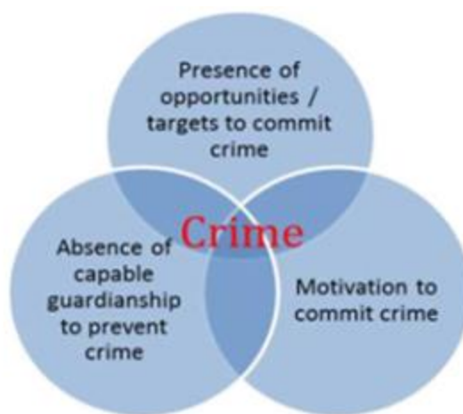
Figure 2. Routine Activity Theory in Crime (Source: Choo, 2011; as cited in Samonas, 2014)

This opportunity crime theory is also known as routine activity theory. Cohen and Felson (1979) showed that structural changes in routine activity patterns can influence crime rates because of the inclusion of the following three elements as shown in the Figure 2: (1) motivation to commit crime, (2) presence of opportunities/targets to commit crime, and (3) the absence of capable guardianship to prevent crime.