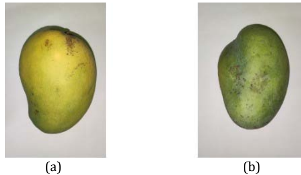
Figure 3. Sample image of: (a) regular Harumanis mango with symmetrical and well-formed, and (b) misshapen Harumanis mango with asymmetrical and not well-formed

defects. In contrast, Grade 2 mango shows more noticeable imperfections, including irregular uneven colour, or minor surface blemishes, although they remained suitable for consumption [8]. To ensure a comprehensive dataset as shown in Figure 3, both regular (symmetrical and well-formed) and irregular (asymmetrical or misshapen) shapes were included. This approach captured the natural variation present in commercial practice and allows classification system to be evaluated across a broader range of samples. Prior to image acquisition, each mango was carefully inspected to exclude samples with bruising, cuts, fungal infections or other signs of damages. These selected mangoes were gently cleaned using a soft, dry cloth to remove any surface dirt or debris, ensuring that image quality and feature extraction would not be affected by external contaminants.