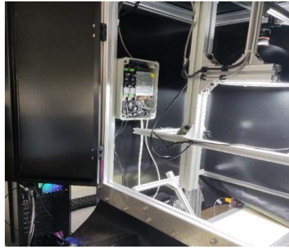
Figure 4. Experimental imaging setup showing the camera mounting and control system within the custom-built enclosure

Each mango was placed individually at the center of the platform in a consistent orientation. After capturing each image, the mango was replaced with the next sample using the same procedure. All images were taken at high resolution to ensure sufficient detail for colour and feature analysis. Each image was labeled with a unique identifier based on its grade and stored securely for further processing and analysis.