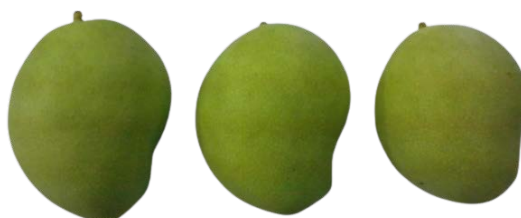
Figure 1. Samples of Harumanis mango fruit

The cultivation of Harumanis mango has become a significant economic activity in regions where they are grown. Increasing demand for this variety has encouraged the expansion of mango orchards and commercial-scale production, providing farmers with a valuable source of income and contributing to local economic development [5]. Figure 1 shows samples of Harumanis mango, which are also the ones used in this study.