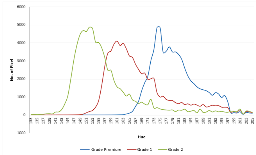
Figure 6. Colour analysis of Harumanis mango using the hue method