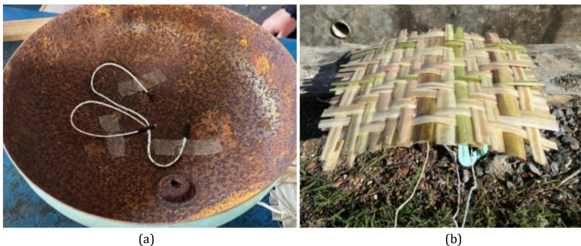
Figure 2: The setup for the blast test. (a) Placement of thermocouples inside the confined space and (b) Arrangement of the banana bomb blanket specimen during blast testing.

All sensors and measuring devices were activated prior to detonation to establish baseline readings. Temperature data were recorded continuously during each blast event. The same experimental arrangement was used for all layer configurations to allow direct comparison of blast response. The overall setup is illustrated in Figure 2. Multiple thermocouples were positioned at different locations within the confined space to capture spatial temperature variations and improve measurement reliability and repeatability.