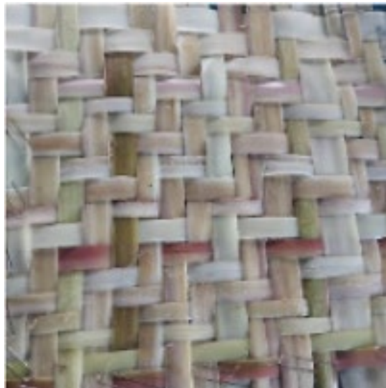
Figure 1: Twill-woven banana fiber blanket.

After drying, the fibers were aligned and woven into a twill woven pattern as shown in Figure 1, using identical weaving parameters to maintain uniform fabric quality across all specimens. The woven banana fiber blanket was subsequently cut into standard dimensions of 30 cm × 30 cm, ensuring consistent geometry and structural uniformity for all blast test samples.